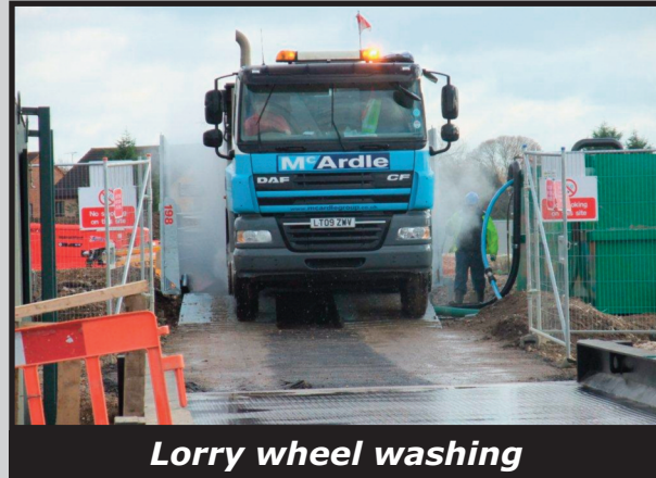
Lorry wheel washing

We began relatively conservatively with the daily number of lorries removing the stockpiles of Japanese knotweed and slurry wall excavations, totalling in the order of 40 outbound movements, to iron out any teething problems that may have occurred.