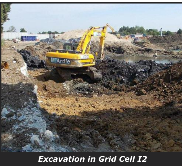
Excavation in Grid Cell I2