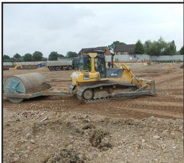
Backfilling in Grid Cell I2