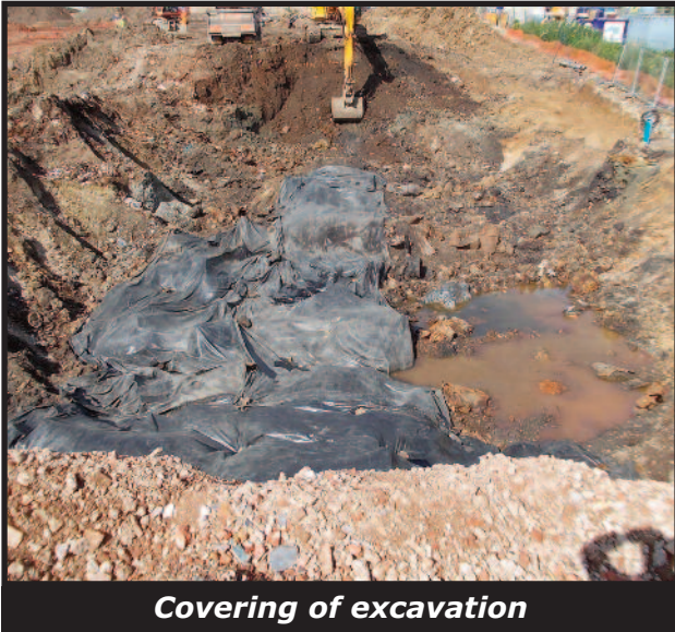
Covering of excavation

for imported clean material prior to placement and compaction.