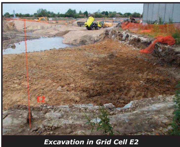
Excavation in Grid Cell E2

Validation of Grid Cells C1, C2, D1 and D2 is now underway with many of the validation points in C1 and C2 having already passed with many other results pending.